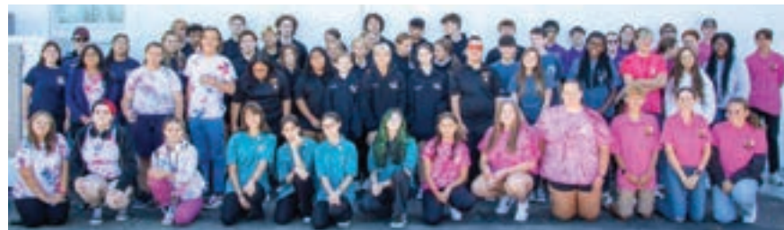
Over 60 Antlers from several lodges attended this year's Army Of Hope picnic. As our families exited Lacey Lodge with their escorts to head to the pavilion to be introduced, they were greeted by our Antlers who formed an honor guard. Our Antlers also served our families all afternoon.