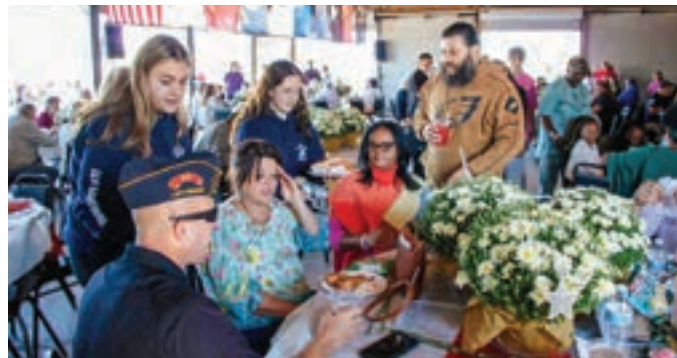
Our Antlers assisted our special guests throughout the afternoon with whatever they needed.