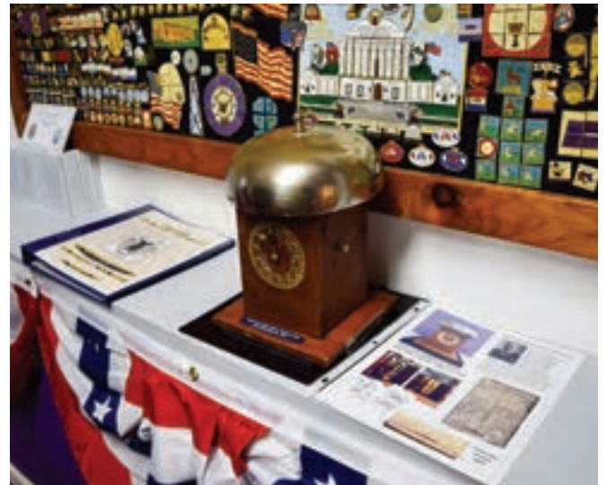
On display from Somerville Lodge No. 1068 is their original 11 o'clock chime.