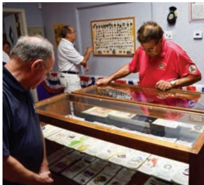
There are several display cases in the two rooms. The cases contain memorabilia from our Past Grand Exalted Rulers, Past State Presidents, Special Children's Committee, and lodges that have celebrated anniversaries.