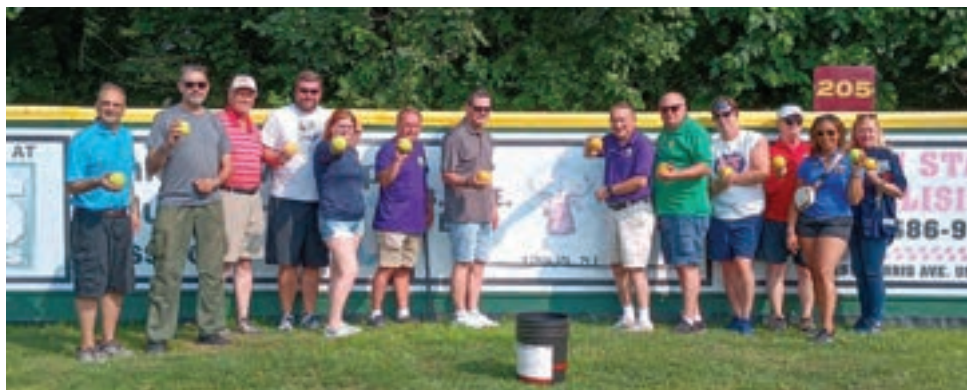
East Central District

District Batters-Up programs were held to advance district winners to the finals.