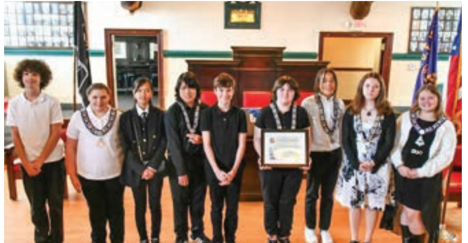
Rahway Antlers Lodge No. 39

Long Branch Antlers No. 21 took a break from hosting a car wash on June 23rd to pose for a picture. The Antlers collected approximately $600 which will be presented to the Long Branch Police Department. Their donation will be used towards a vest for one of the police dogs.