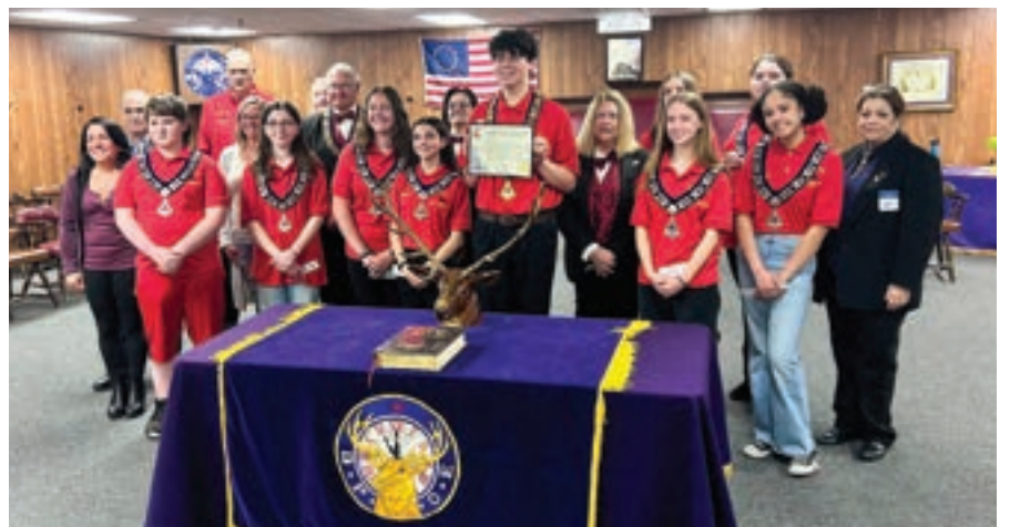
Toms River Antlers Lodge No. 40