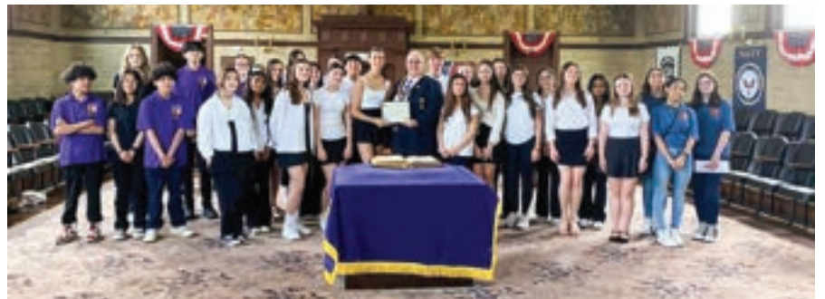
Rutherford Antlers Lodge No. 41